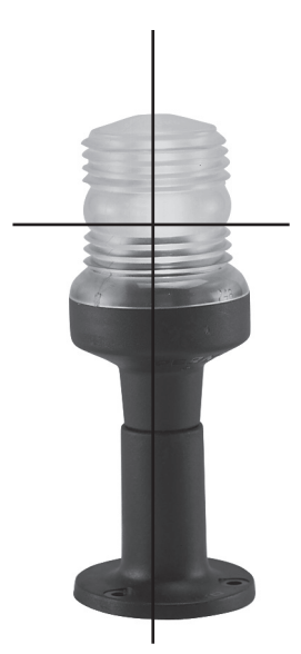
Fig. 0455 Series (Power Driven Vessels Only)